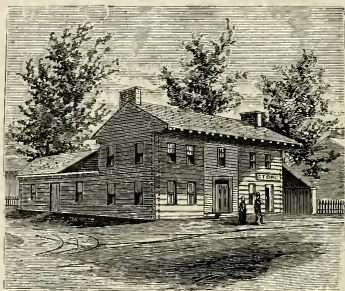
OLD SARCHET HOUSE, BUILT 1807.

First house erected in Cambridge, in which was the first store, in which the first church was organized, and in which the first funeral sermon was preached. Location, north-east corner of Seventh St. and Wheeling Ave.